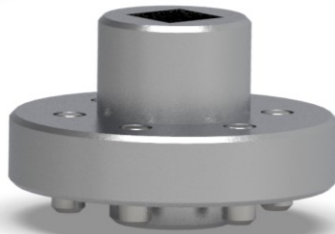
A6 Base Spanner For Installation of A6 Part Number: TM-C1040B