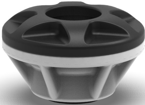
A6 Top Spanner For Installation of A6 Part Number: TM-C1040A

The A6 Pressure Relief Valve is ideal for any application where compactness and reliability are critical. The opening and closing pressures are accurately pre-set and repeatable.