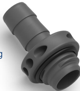
Screw-In Hose Adaptor Assembly With Spring Part Number For \varnothing 16mm I.D Hose: 1312003 Part Number For \varnothing 20mm I.D Hose: 1312004

Refer: D7 Installation and Service Instructions Document Number: M-08-IS-1D7 Revision 2b