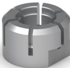
D7 Screw-in Hose Adaptor For Inflation Part Number \varnothing 20mm I.D Hose: 1312002 Part Number \varnothing 16mm I.D Hose: 1312001