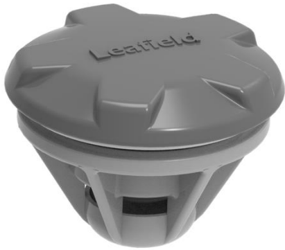
D7 Top Spanner For D7 Installation Part Number: C16603

The D7 valve is designed for use in demanding applications where a compact design is required; such as Military and Commercial RIBs, River rafts and Inflatable Boats. Available in two versions, standard and high pressure (high pressure for uses such as drop stitch applications).